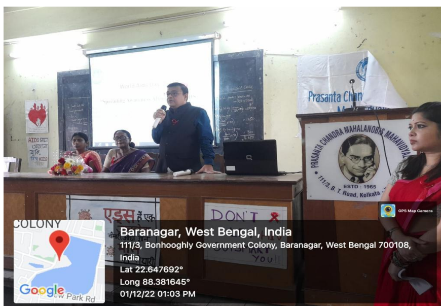
Capacity Building Programme on HIV/AIDS: Awareness and Action: Inaugural Session