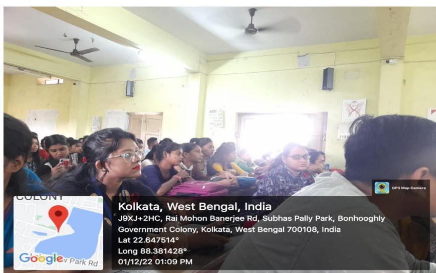
Students Attending the programme on HIV/AIDS: Awareness and Action